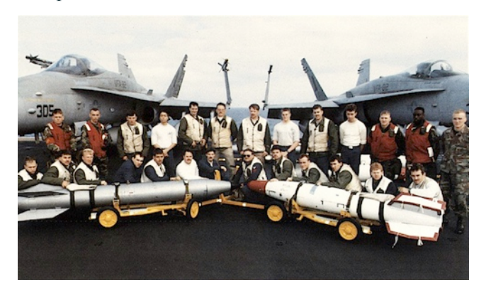
B61 and B57 nuclear weapons are displayed on board the USS America (CV-66) during its deployment to Operation Desert Storm in 1991.

"During the naval deployments in support of Operation Desert Storm against Iraq in early 1991, the aircraft carrier USS America (CV-66) deployed with its nuclear weapons division (W Division) and B61 nuclear strike bombs and B57 nuclear depth bombs. The W Division was still onboard when America deployed to Northern Europe and the Mediterranean in 1992.