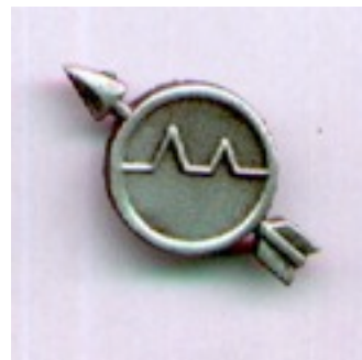
RD bubble hat pin no longer available